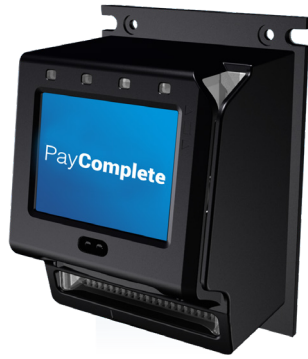
UPT-B Combo Card Reader/Bill Validator Bezel