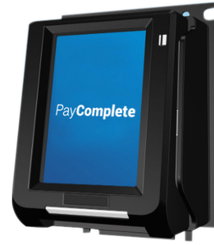
UPT-F Card Reader